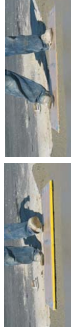
Step 1 - Position